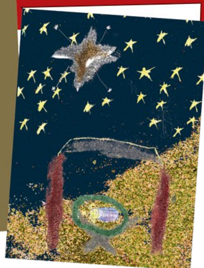
Away in a Manger