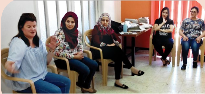
That's me on the left discussing music therapy methods to professional health-givers at BASR

Music therapy is an interactive, primarily non-verbal intervention, provides a process through which children can express themselves, become aware of their feelings and interact more easily. Music therapy can provide insights into a child's functioning. source BAMT (British Association for Music Therapy).