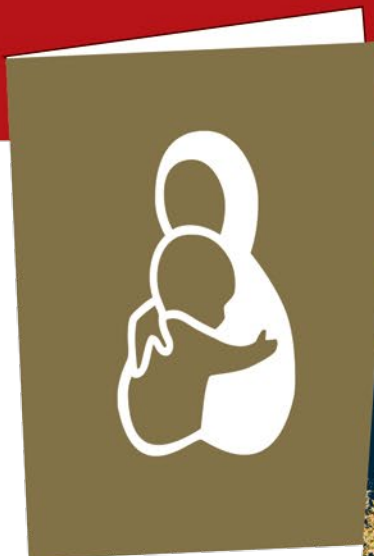
Mother & Child